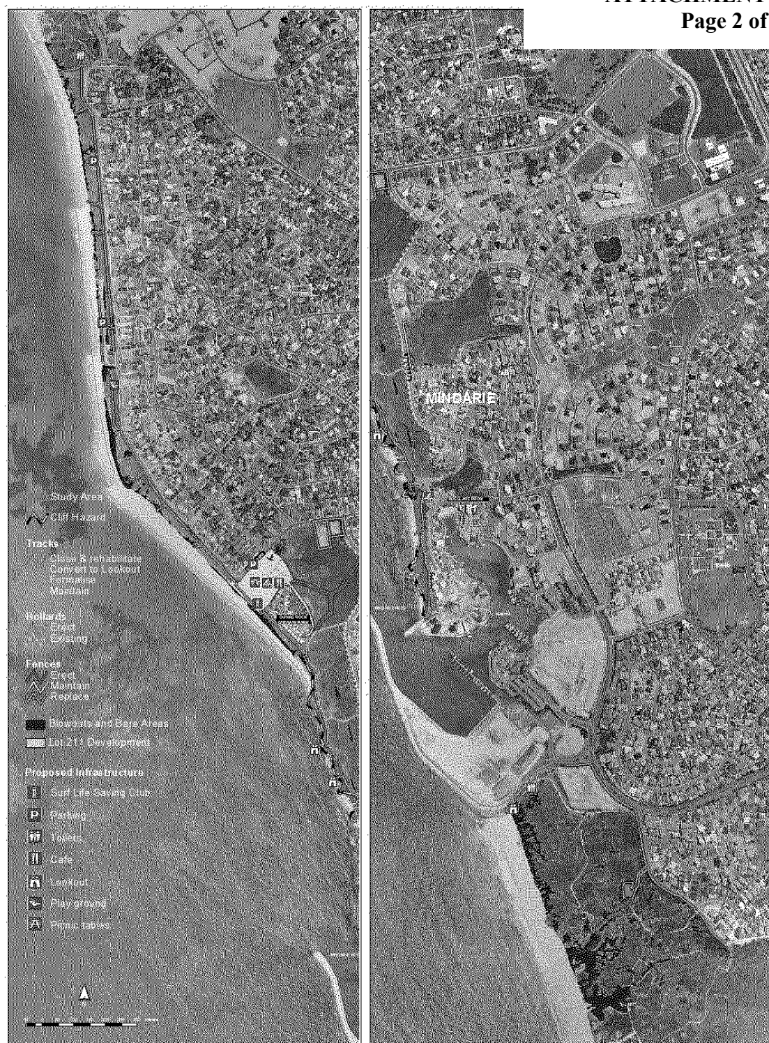
Map 5: Infrastructure, Proposed Facilities, Dune Blowouts and Shoreline Hazard

CUSTOMER: CITY OF CHANDLER PROJECT: TRANSITION TO GRANT'S ROOM FOR SHORE MANAGEMENT PLAN JOB NO.: 1003 DATE: 1-2-2003