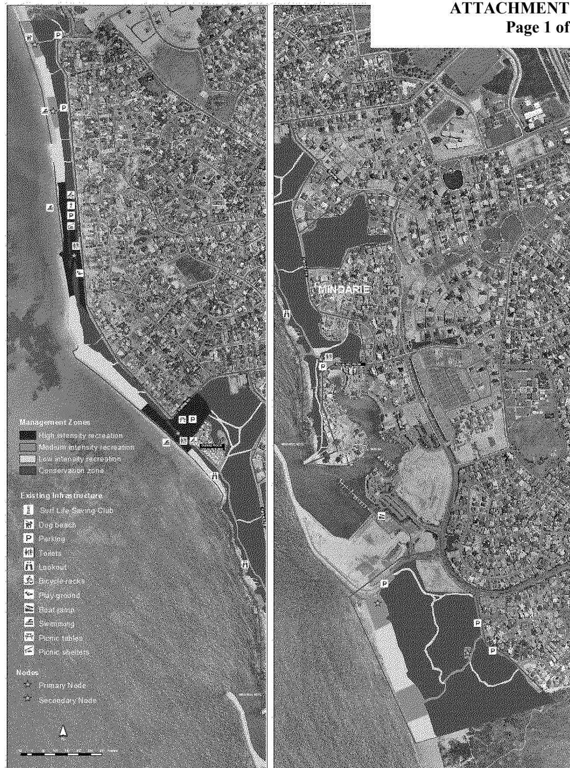
Map 4: Management Zones, Nodes and Existing Facilities

CLIENT: CITY OF WANNEROO PROJECT: WANNEROO COASTAL RECREATION MANAGEMENT PLAN JOB NO: 1001 DATE: 27-09-02